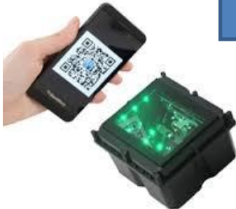
Leitores Barras e QR-Code