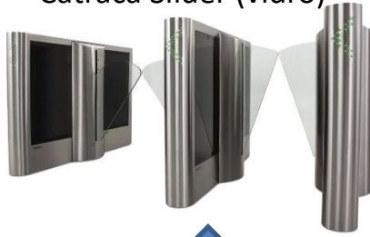
Catraca Slider (vidro)